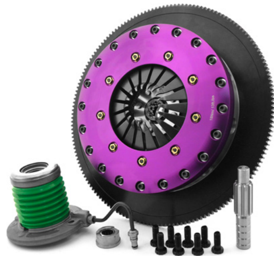
Kit Pictured: XKFD23656-2G

The Ford Mustang is one of the most iconic vehicles ever created and is arguably one of the most modified cars with thousands of aftermarket parts available around the world. XClutch offer a wide range of performance upgrades to suit vehicles that have had performance modifications resulting in increased horsepower and torque. These kits are designed to harness the extra power and help put more to the ground. With extensive in-house testing and development, XClutch offers a range of clutch upgrades to suit everything from the daily driven performance car through to dedicated motorsport applications.